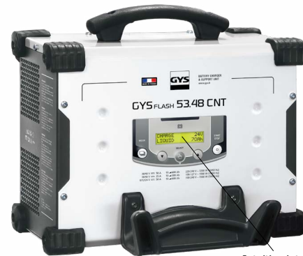
Intuitive interface available in 22 languages