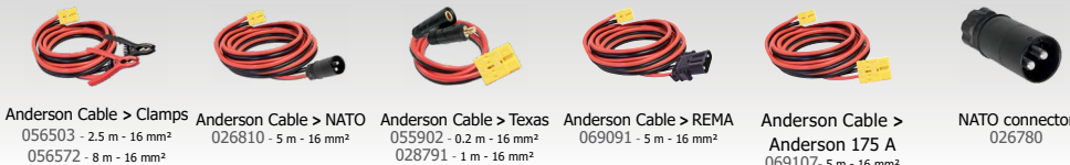
Anderson Cable > Clamps 056503 - 2.5 m - 16 mm 2 056572 - 8 m - 16 mm 2