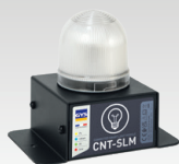
SLM : Smart Light Module 027978