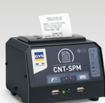
SPM : Smart Printer Module 026919